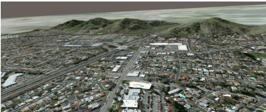
Figure 1. Vacaville OpenFlight Database Provided by AVT Simulation Loaded into Unity

More specifically, a simulation middleware SDK has been developed by SimBlocks.io to connect the Unity game engine with military training simulation systems. In relation to asset reusability, for instance, an OpenFlight model and terrain importer has already been engineered to permit OpenFlight files to be directly loaded into Unity's editor (see Figure 1). While popular commercial game engines like Unity and Unreal support import of interchange formats such as FBX and OBJ files in their editors, they do not support import of models saved in either format at runtime out-of-the-box. This middleware, on the other hand, enables run-time conversion of OpenFlight models into Unity's native asset format eliminating the need to import through the editor. In other words, both game-ready interchange and runtime formats for rapid model and terrain streaming on the client are generated.