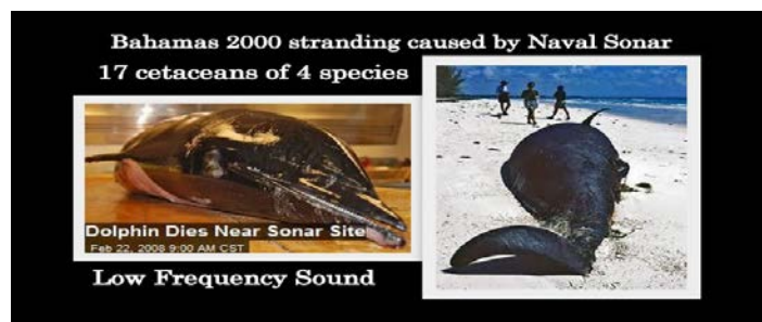
Figure 2 Environmental Issue Killed Whales and Created a Paperwork Burden for Future Exercises

Another problem arises when live exercises depend upon climatological models. Live implies the here and now and in environmental terms, that means weather not climate. An environmentally tragic incident occurred when a live exercise use the best available climate models to make sure there would be no ill effect on aquatic creatures as a result of sound injected into the ocean. This was the right way to approach the initial design, but as luck would have it, the Gulf Stream which meanders was in a radically different position from the climatic average. Live sampling of the water temperature would have informed the exercise managers that something was wrong. Realizing that a live measurement was necessary to check that the model applied would have saved beaked whales from beaching themselves and dying. When using statistical results, it is truly important to check whether or not the average represents the current conditions. (C1, C2, C9) Lack of understanding could have been remedied by having a technical team assess live measurements on site during the exercise.