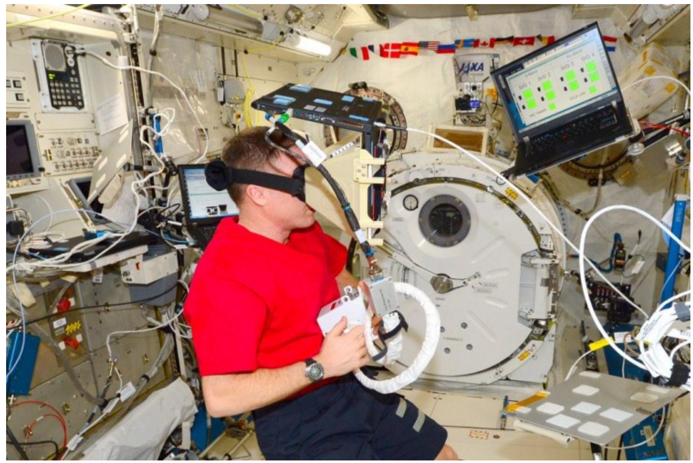
Figure 4. Laptop as HMD onboard the ISS