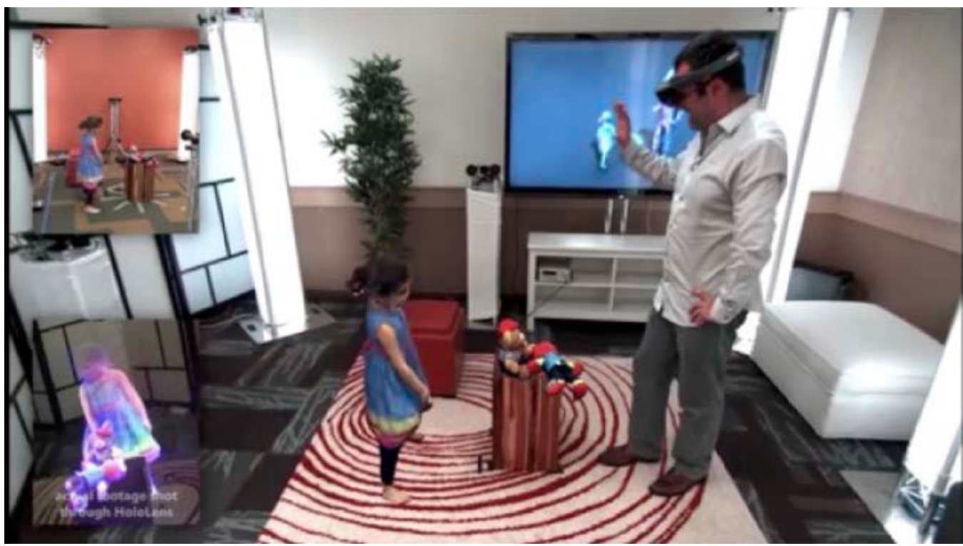
Figure 8. Microsoft "Holograms" demonstration