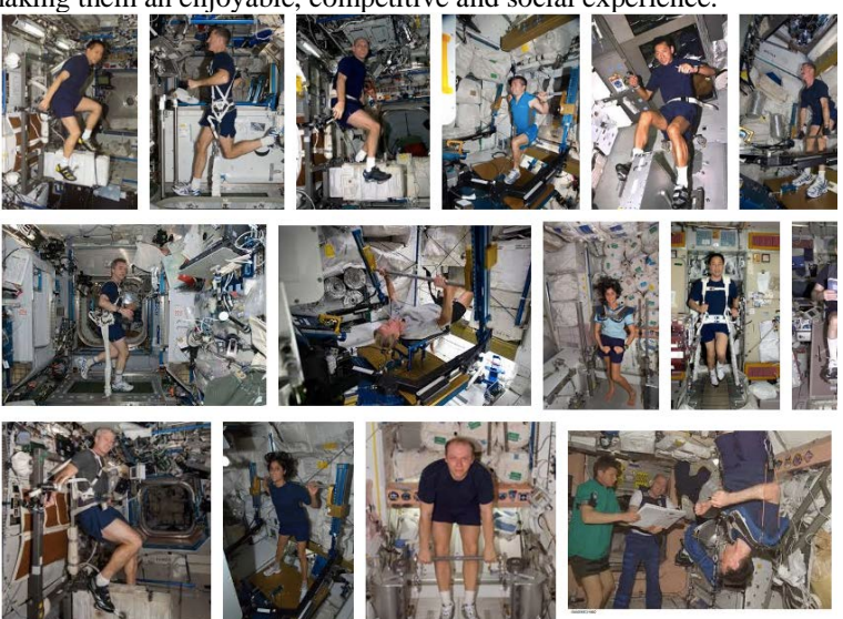
Figure 7. Exercise on board the Space Station

Astronauts must vigorously exercise 2 hours per day just to maintain a manageable level of bone and muscle loss. VR could help gamify the exercises making them an enjoyable, competitive and social experience.