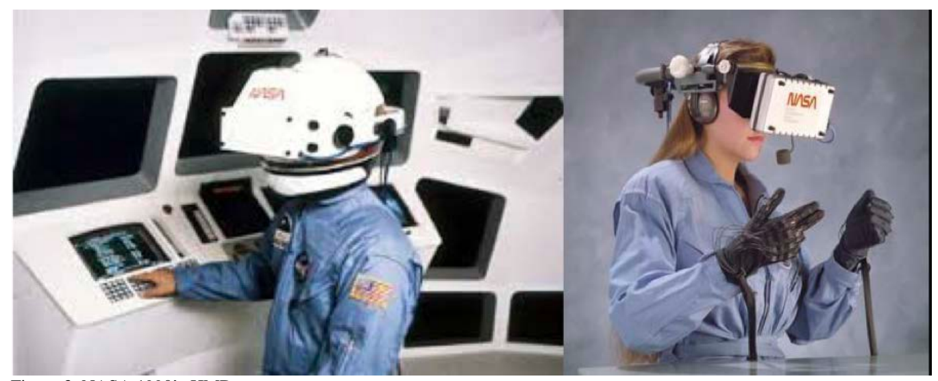
Figure 3. NASA 1990's HMDs

NASA built several motion flight sims as computers and projection technology advanced. A need made all the more important to allow the astronauts to rehearse for the landing of Space Shuttles. Thanks to laptops, astronauts could bring portable versions of their flight sims with them and practice the landing while in low earth orbit. The Mid 1990s saw an explosion of VR, both the higher end SGI powered systems from VPL, and 3 competing commercial systems were released for home PC: Virtual iO, Cybermax and Forte. NASA experimented with these systems and built their own. Though all came up well short in terms of performance and resolution (Figure 3.), they still served as valuable stepping stones and research platforms from mission rehearsal to visualization.