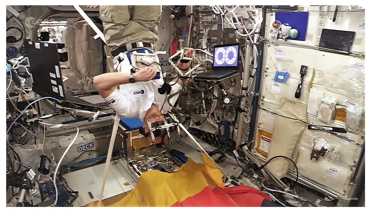
Figure 6. Oculus Rift FUTURE

The Oculus Rift (Figure 6), with a modified InfraRed tracker, has been used on board the ISS to help determine how astronauts' perception adapts to low earth gravity.