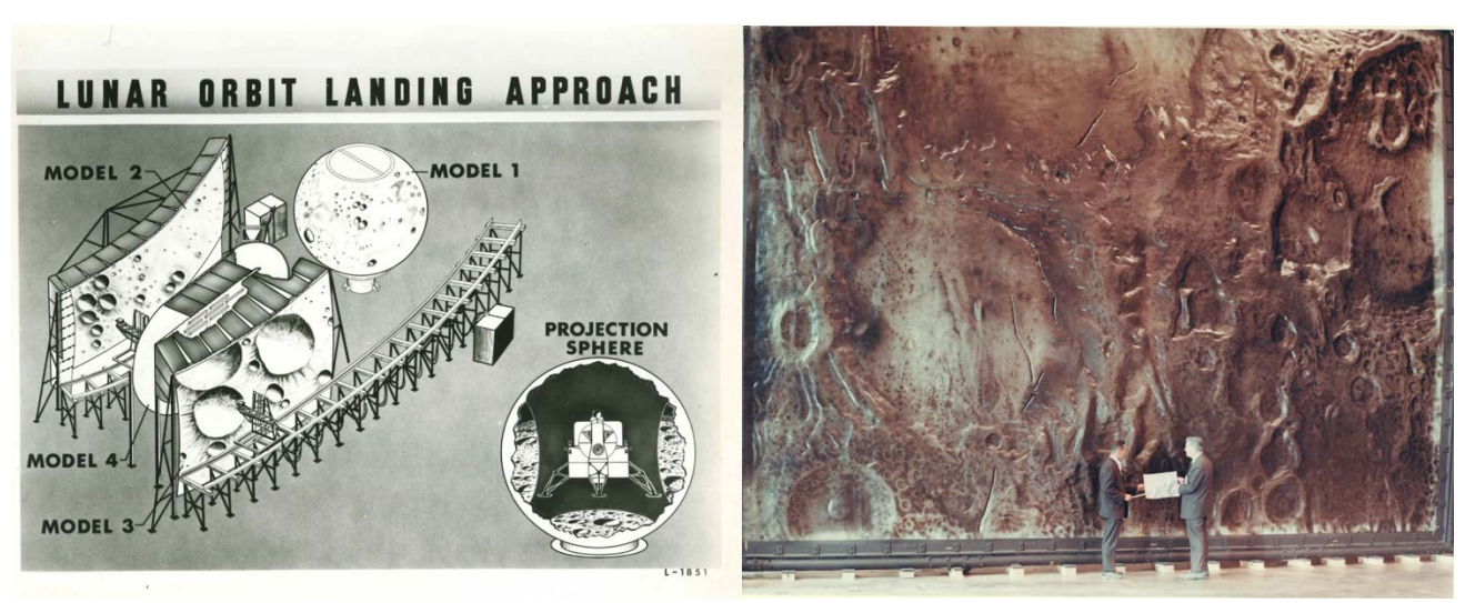
Figure 2. LOLA Schematic and Model with Worker for Scale

NASA built several motion flight sims as computers and projection technology advanced. A need made all the more important to allow the astronauts to rehearse for the landing of Space Shuttles. Thanks to laptops, astronauts could bring portable versions of their flight sims with them and practice the landing while in low earth orbit. The Mid 1990s saw an explosion of VR, both the higher end SGI powered systems from VPL, and 3 competing commercial systems were released for home PC: Virtual iO, Cybermax and Forte. NASA experimented with these systems and built their own. Though all came up well short in terms of performance and resolution (Figure 3.), they still served as valuable stepping stones and research platforms from mission rehearsal to visualization.