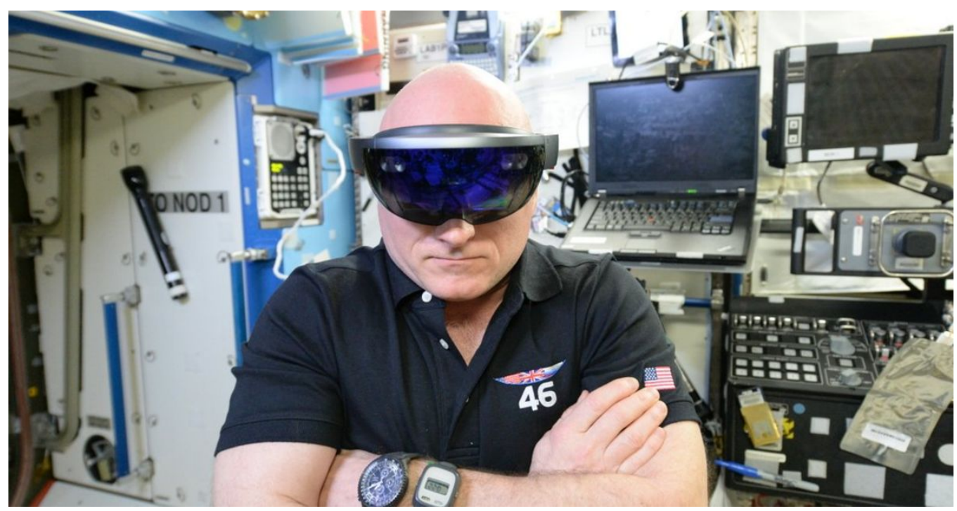
Figure 5. Microsoft HoloLens