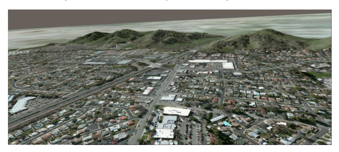
Figure 1. Vacaville OpenFlight Database Provided by AVT Simulation Loaded into Unity

More specifically, a simulation middleware SDK has been developed by SimBlocks.io to connect the Unity game engine with military training simulation systems. In relation to asset reusability, for instance, an OpenFlight model and terrain importer has already been engineered to permit OpenFlight files to be directly loaded into Unity's editor (see Figure 1). While popular commercial game engines like Unity and Unreal support import of interchange formats such as FBX and OBJ files in their editors, they do not support import of models saved in either format at runtime out-of-the-box. This middleware, on the other hand, enables run-time conversion of OpenFlight models into Unity's native asset format eliminating the need to import through the editor. In other words, both game-ready interchange and runtime formats for rapid model and terrain streaming on the client are generated.